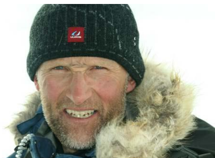
Vegard Ulvang Chairman of the FIS Cross-Country Committee

I wish you all much success on the Tour and look forward to seeing you on top of Alpe Cermis!