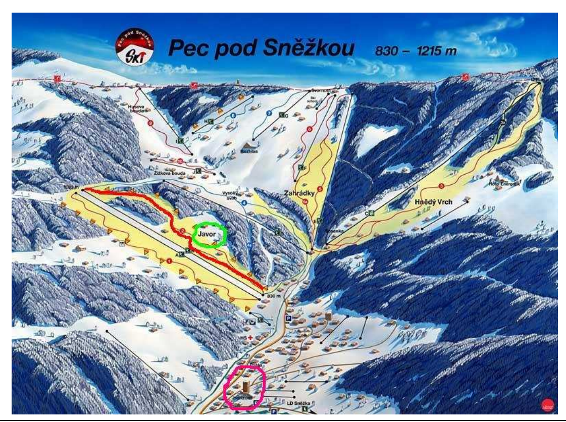
Page 3 of 3