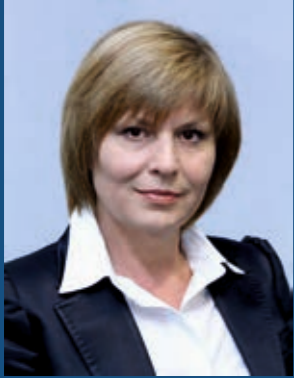
MARIANA GEORGIEVA Minister of Youth and Sports