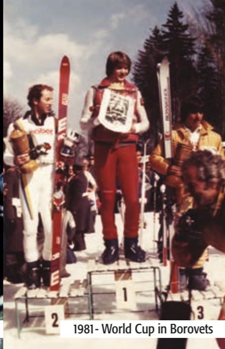
1981 - World Cup in Borovets