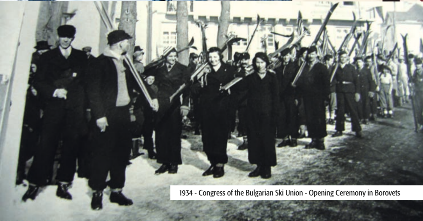
1934 - Congress of the Bulgarian Ski Union - Opening Ceremony in Borovets