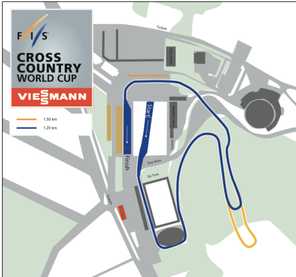
Otepää Sprint, 1,5 km