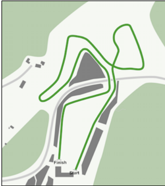
Lillehammer, Sprint Men, 1,5 km