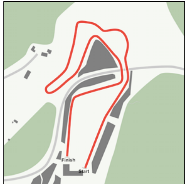
Lillehammer, Sprint Ladies, 1,2 km