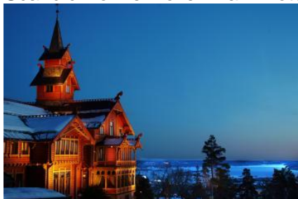
Scandic Holmenkollen Park Hotel, Oslo