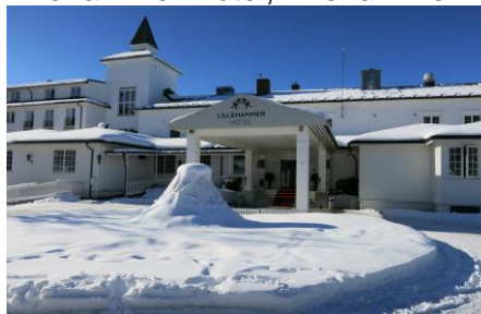
Lillehammer Hotel, Lillehammer