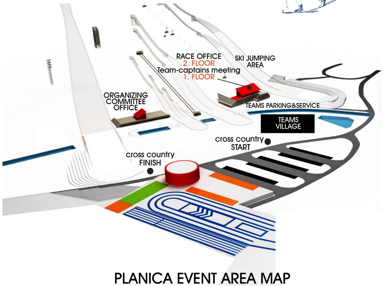
PLANICA EVENT AREA MAP