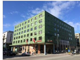
Quality Hotell River Station Drammen, Raw Air Men