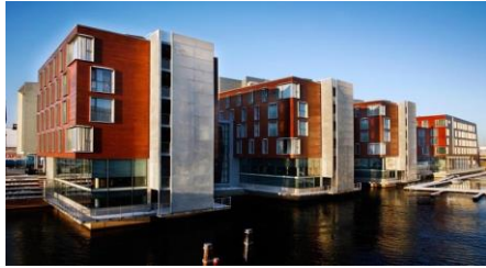
Scandic Solsiden Hotel, Trondheim Raw Air Women