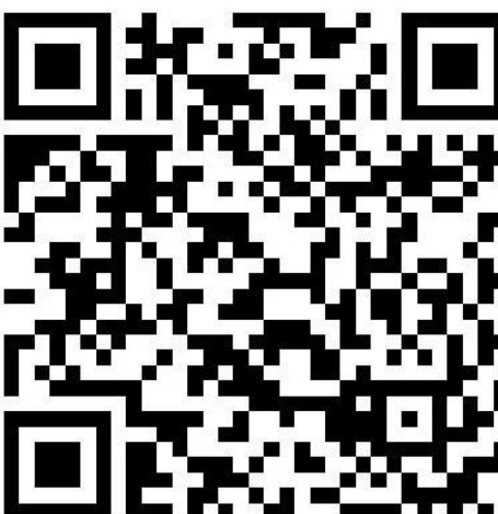
Covid-19 Testpoint Wengen (italiano)