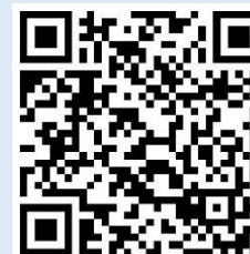
Covid-19 Testpoint Wengen (italiano)