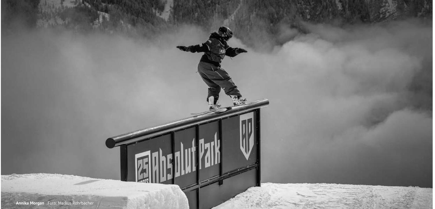
Annika Morgan